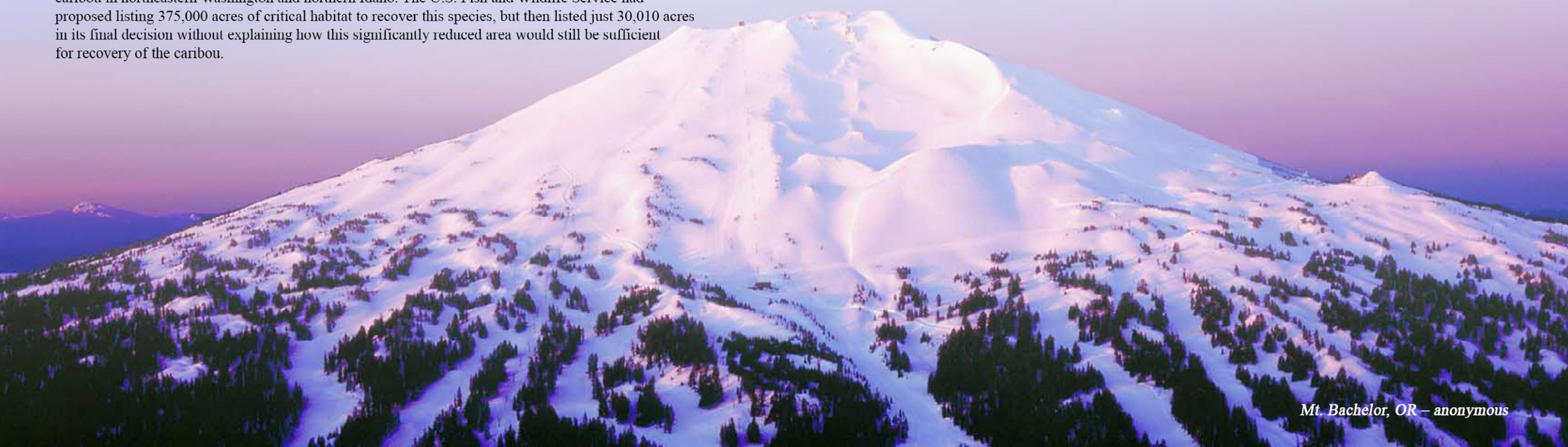
Mt. Bachelor, OR – anonymous

Finally, we are working to wrap up the years-long litigation against the Forest Service for failing to conduct proper environmental analyses before renewing grazing permits on hundreds of allotments across the West. AW participated in three cases in California, Oregon, and Idaho. We were successful in California and Oregon, achieving court decisions that require the Forest Service to conduct environmental analyses on many allotments in those states. We are close to settling the Idaho case, which would also require analyses for allotments in Idaho, Utah, and Wyoming, and hope to have a final settlement in the next couple months. That would put an end to a five-year saga and hopefully the Forest Service's attempt to escape proper environmental review of grazing impacts.